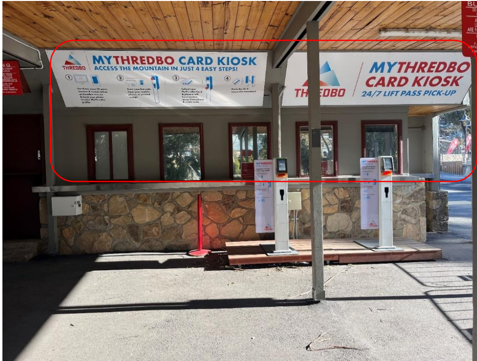
Figure 1: Ticket windows to be re-instated with new windows

The Guest Services building is located on the same lot as the main Valley Terminal building. The proposed amendment is largely the same as the original proposal i.e. replacement of cladding and window replacement in the areas identified above. Note, approval is not being sought for cladding and window replacement on the entire Guest Services building. The materials and colours for the proposed works will be in keeping with the existing buildings.