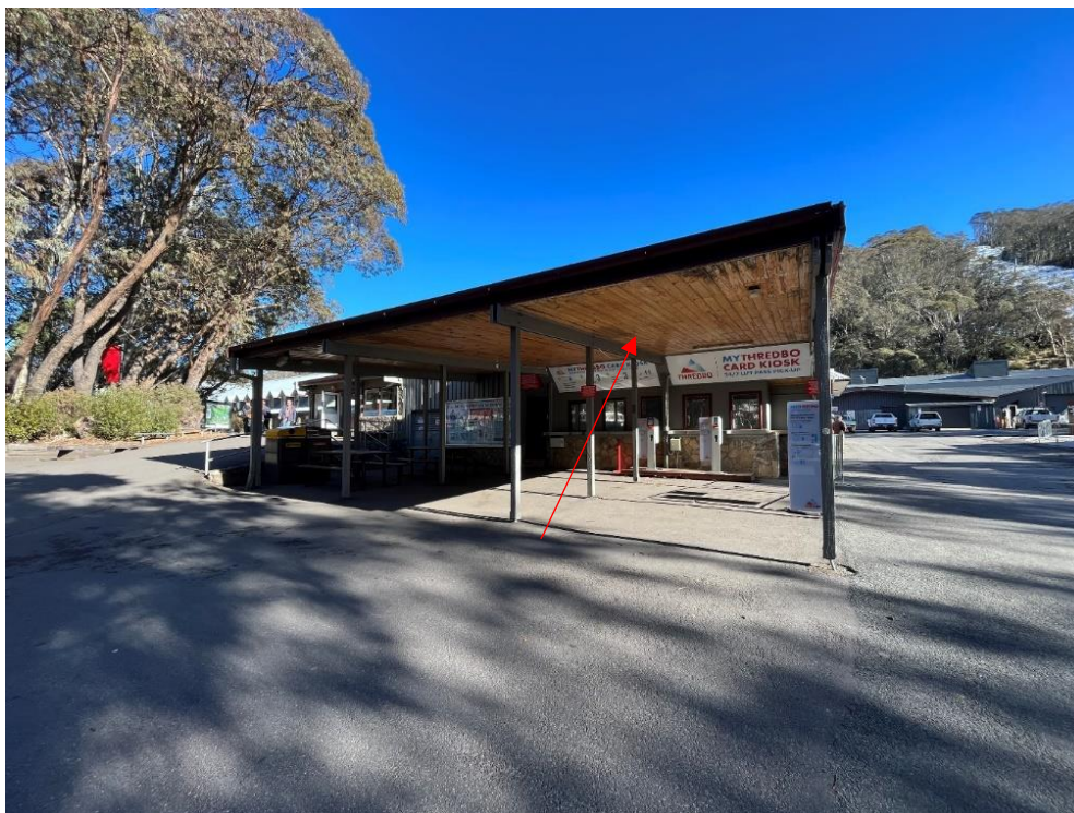
Figure 2: Cladding on underside of awning to be replaced with like-for-like materials